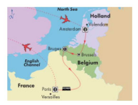
DAY 1, Saturday - Depart for the Netherlands Depart for the Netherlands

*call for dates and rates from your departure city